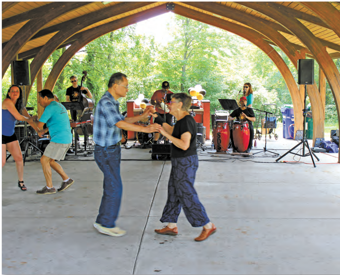
MADLINE DOLBY | PRESS PUBLICATIONS