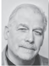
Angle of View Paul Dols

In general, I try to resist the impulse to delve into the dark and seemingly endless rabbit hole of conspiracy theories. However, with the continuing and rapid rise of prices on many of the various services we have come to rely on, combined with the complicated and unpredictable maze of modern customer service, it can sometimes seem like there is a plan or business model that is purposefully stacking the odds against us. The steady rise in the prices of internet connectivity, mobile phones, electricity, insurance, waste collection and other services can at times feel quite demoralizing. Fortunately, the occasional success and positive problem resolution have helped keep a glimmer of hope alive.