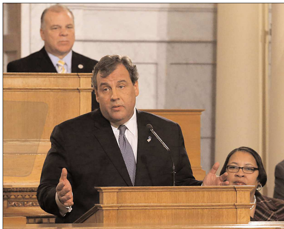
Gov. Chris Christie delivers his State of the State speech Tuesday at the State House in Trenton.