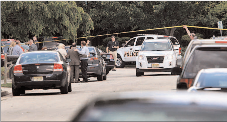
Police work near the scene of Thursday's homicide on Woodstock Drive in Linwood.

■ The Linwood woman was so heavily involved in her community, she received a governor's award for service.