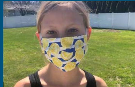
Student's Own Mask