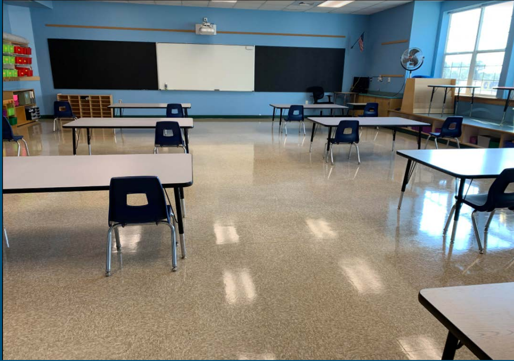
Primary Learning Center Classroom