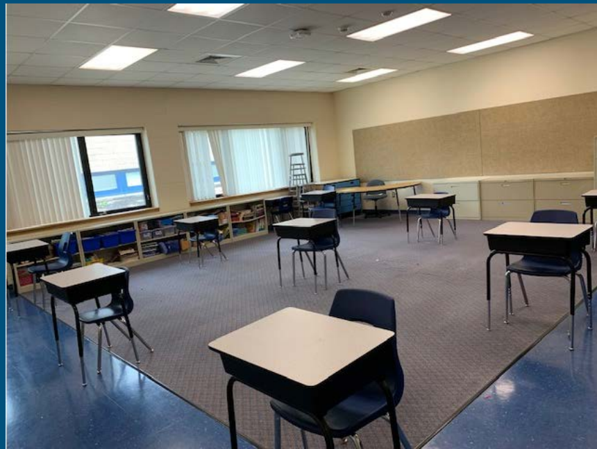
McKinley Avenue Classrooms