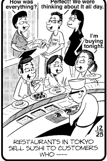
RESTAURANTS IN TOKYO SELL SUSHI TO CUSTOMERS WHO —

Now arrange the circled letters to form the surprise answer, as suggested by the above cartoon.