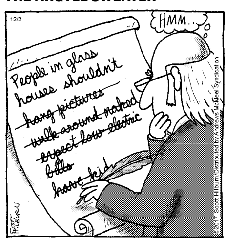
FEW PEOPLE KNOW THAT IDIOMS DIDN'T COME NATURALLY TO BEN FRANKLIN