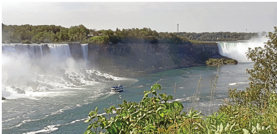
Niagara Falls formed when glaciers receded at the end of the last ice age. They are both beautiful and an important source of hydroelectric power.

The house is decorated just like you remember from the movie. Crawl into the kitchen cabinet where Randy quivered, fearing the Old Man was going to kill Ralphie. Make a phone call on the