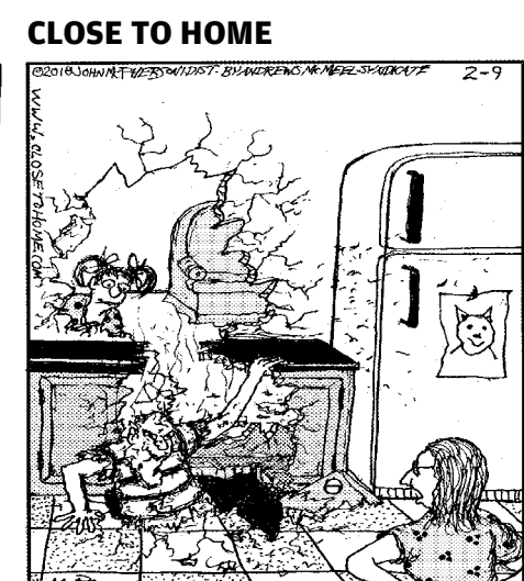
"I told you. You've got to poke three or four holes in the potato before you put it in the microwave.