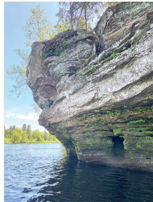
AMY ARNTSON | NORTH PINE COUNTY NEWS

Do you want to give kayaking a try? Lakeside Traders in Moose Lake now offers kayak rentals during their normal business hours. The rental fee covers life jackets and paddle. Customers can use