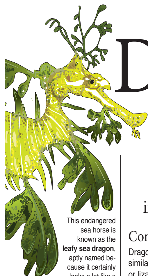
This endangered sea horse is known as the leafy sea dragon , aptly named because it certainly looks a lot like a dragon.

SOURCES: World Book Encyclopedia, World Book Inc.; https://www.britannica.com/ ; https://kids.kiddle.co/Dragon ; https://www.factretriever.com/ ; https://www.softschools.com