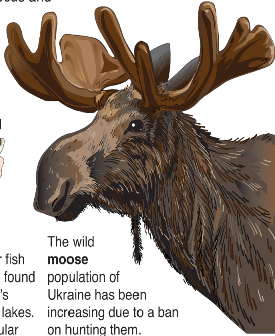
The wild moose population of Ukraine has been increasing due to a ban on hunting them.

Saint Sophia Cathedral in Kyiv was built in the early half of the 11th century.