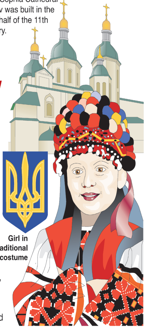
Girl in traditional costume

Saint Sophia Cathedral in Kyiv was built in the early half of the 11th century.