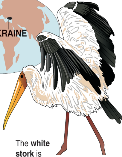
The white stork is widely considered to be the national bird of Ukraine. It is seen as a symbol of family, loyalty and patriotism.