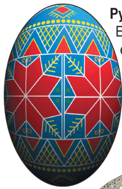
Pysanki Easter eggs

Key native trees include pine, oak, birch and hornbeam, with pine being the most dominant forest species. Other significant plants include the sunflower, spring primrose, snowdrop, crocus and various wildflowers.