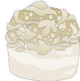
Korovai wedding bread