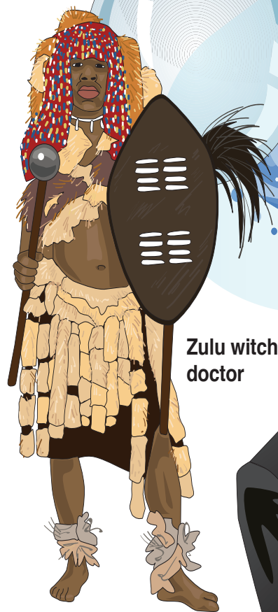
Zulu witch doctor

In some places, magicians need a license to use a rabbit in their shows.