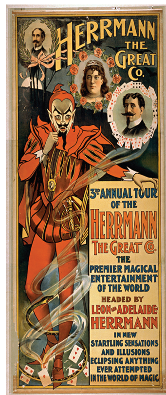
Alexander Herrmann (1844 – 1896)

Many old magic show posters and reproductions are highly collectible. They show how magicians advertised their magic acts 100 years ago.