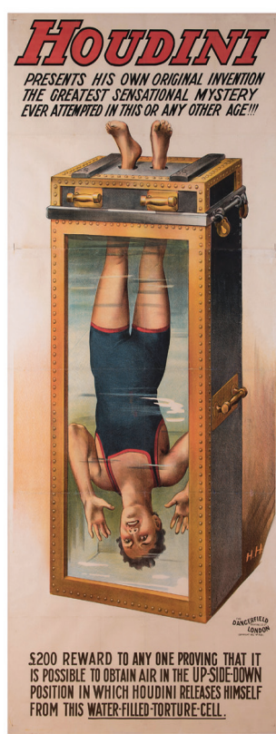
Harry Houdini (1874 – 1926)

Herrmann the Great was a French magician. His wife, Adelaide Herrmann, was also a magician. She was known as the Queen of Magic.