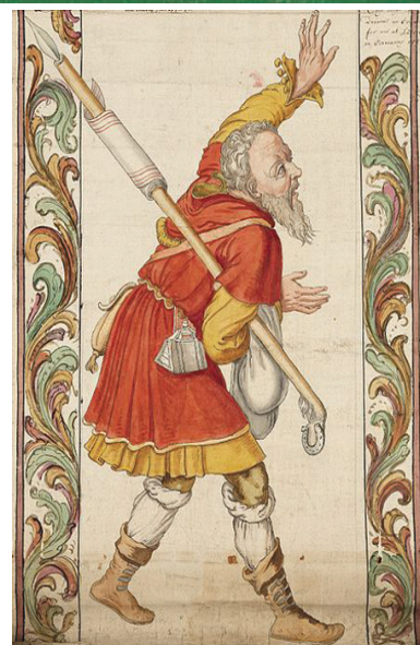
Illustration of George Ripley (one of England's most famous alchemists) from the 16th-century edition of the Ripley Scroll.

Call it hocus pocus, conjuring or wizardry, magic has a long history. Once thought to have supernatural powers, magicians today are celebrated as talented illusionists who can make the impossible seem real.