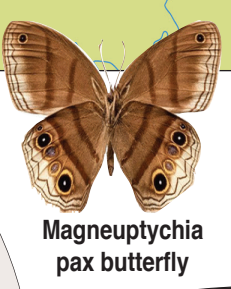
Magneuptychia pax butterfly

The Andean condor is the national bird. It is one of the world's largest birds and can live more than 70 years. This bird was often depicted in indigenous Andean art.