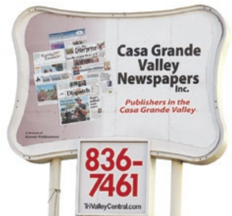
This historic billboard sign was recently renovated for our downtown Casa Grande facility.