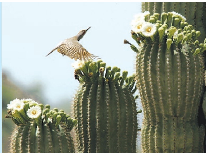
A Northern Flicker visits the giants of the desert during the saguaros' blooming season.

Showcase your advertising amongst prize-winning news, photography and color printing.