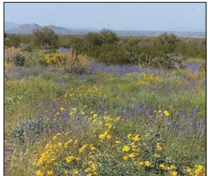
Springtime in the Casa Grande Valley.

10% Discount off local open rate with cash with copy to local churches and non-profit organizations (within the Casa Grande Valley).