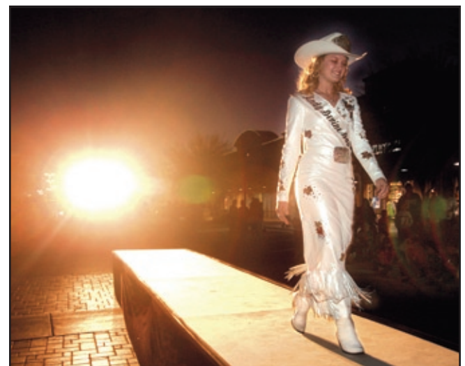
A model takes the runway during the Western Clothing Fashion Show at a Cowboy & Indian Days event.

Some Tabloid Sections measure Full-Page (5-col.) 10-13/16" wide by 16" deep. Center-spread (Double Truck) measures 22-7/8" wide by 16" deep.