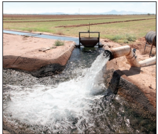
Steven King photo

All weekly contracts can pick up into the Casa Grande Dispatch within a week at $7.84 for the first Dispatch insertion and $5.25 for the second within a week. 3" minimum. Runs into the Tri-Valley Dispatch are weekly rate plus $4.87 premium.