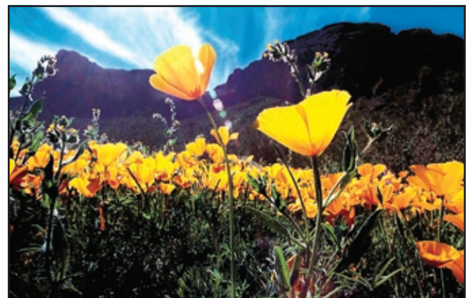
Poppies at Picacho Peak in full bloom in the spring.

10% Discount off local open rate with cash with copy to local churches and non-profit organizations (within the Casa Grande Valley).