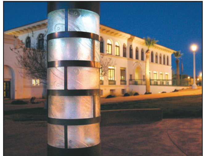
Steven King photo