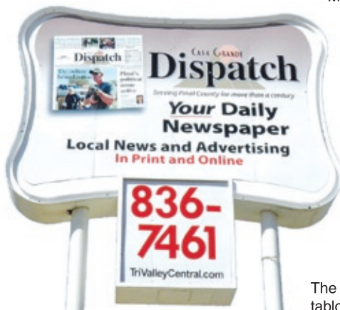
Two-sided sign along 2nd St.