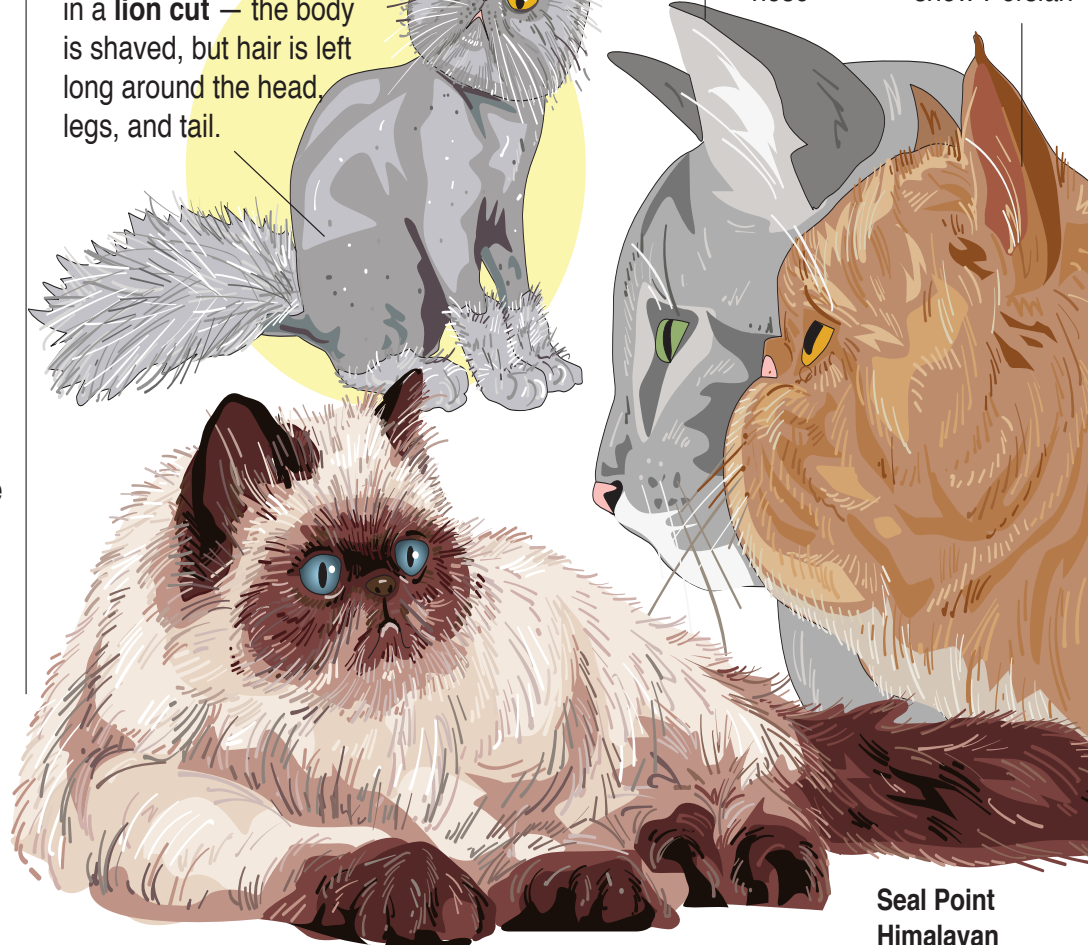
Seal Point Himalayan

Flat face with snub nose of a show Persian