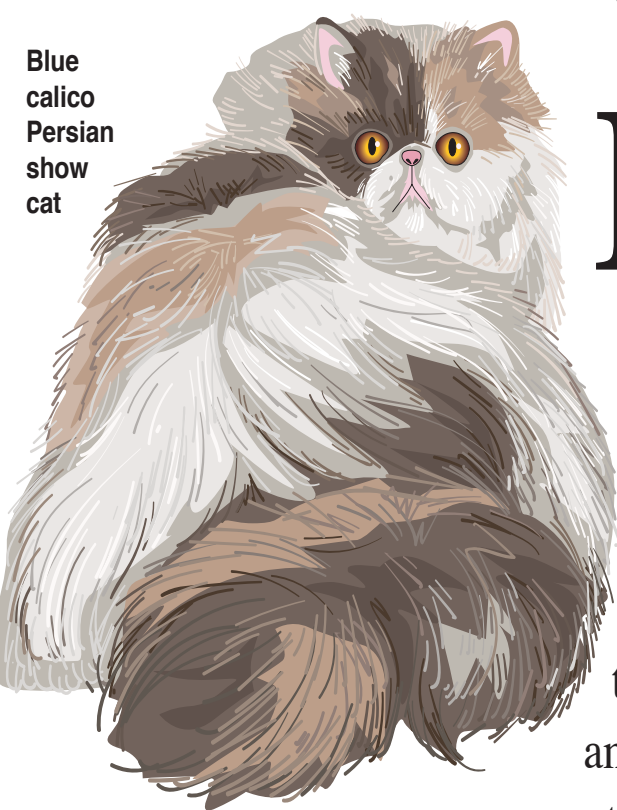
Blue calico Persian show cat