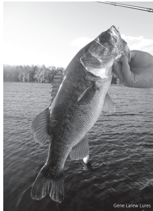
Gene Larew Lures