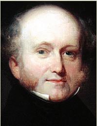
Martin Van Buren

War hero and populist president who had teamed up with real estate interests to profit from illegal settlement of Native American lands.