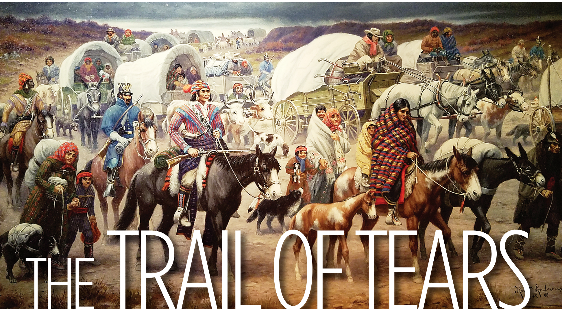
NATIONAL PARK SERVICE