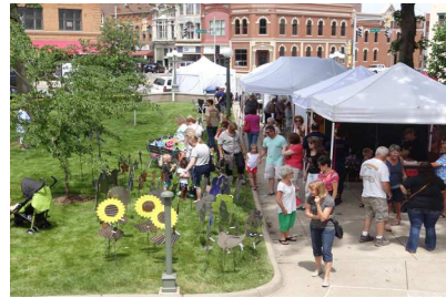
Art on the Square 2016 brought out many artists and customers!