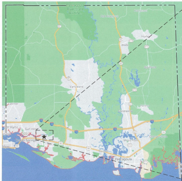
JACKSON COUNTY, MS

Interim City Attorney City Clerk Public Works