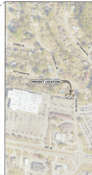
OCEAN SPRINGS, MS