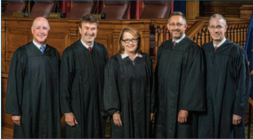
The five justices of the Indiana Supreme Court.