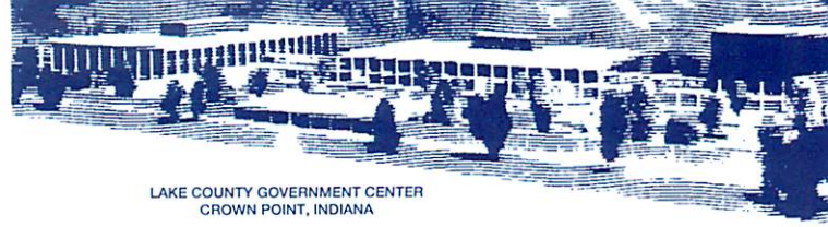
LAKE COUNTY GOVERNMENT CENTER CROWN POINT, INDIANA

LAKE COUNTY GOVERNMENT CENTER 2293 NORTH MAIN STREET CROWN POINT, INDIANA 46307 219-755-3280 FAX: 219-755-3283