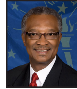
Lonnie M. Randolph State Senator