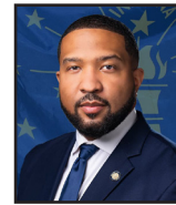
Eddie Melton State Senator