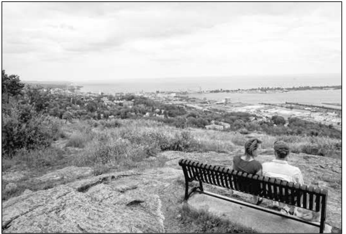
A couple sit on a bench overlooking Lake Superior in Enger Park in Duluth, Minn. The city is working to ensure industry and tourism coexist and thrive. Tourism attracts thousands of visitors and millions of dollars each year.