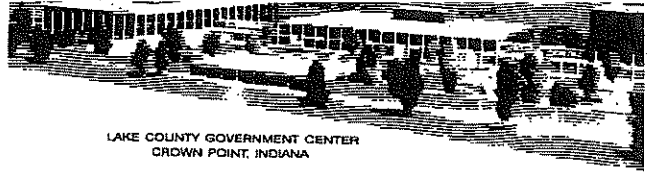
LAKE COUNTY GOVERNMENT CENTER CROWN POINT, INDIANA

LAKE COUNTY GOVERNMENT CENTER 2293 NORTH MAIN STREET CROWN POINT, INDIANA 46307 219-755-3280 FAX: 219-755-3283