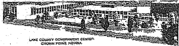
LAKE COUNTY GOVERNMENT CENTER CROWN POINT, INDIANA

LAKE COUNTY GOVERNMENT CENTER 2203 NORTH MAIN STREET CROWN POINT, INDIANA 46307 219-766-3280 FAX: 219-766-3283