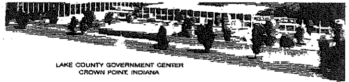
LAKE COUNTY GOVERNMENT CENTER CROWN POINT, INDIANA

LAKE COUNTY GOVERNMENT CENTER 2293 NORTH MAIN STREET CROWN POINT, INDIANA 46307 219-755-3280 FAX: 219-755-3283