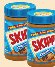
Skippy Peanut Butter 16.3 oz.