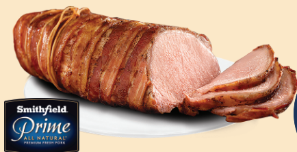
Boneless Center Pork Roast

Friday, Saturday & Sunday January 2 Through January 4 DIGITAL COUPONS AVAILABLE TO CLIP 1/2