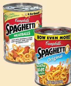
Campbell's SpaghettiOs w/Meatballs 15.6 oz. SpaghettiOs 15.8 oz