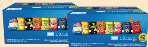
Frito Lay Multipack 42 ct.