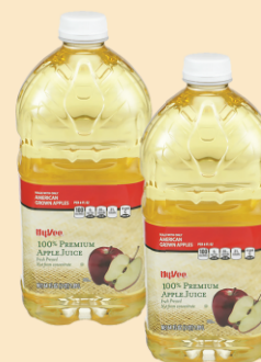
Hy-Vee Apple Juice 64 oz.