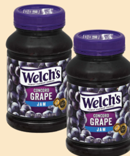
Welch's Grape Jam 30 oz.