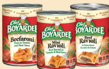
Chef Boyardee 15 oz. Select Varieties