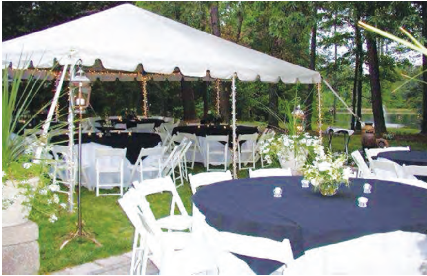
Platinum Entertainment & Party Rentals can create a beautiful setting for your wedding reception or any other special event.

Platinum Entertainment & Party Rentals provides services relatively new to Columbus County. It is a unique business that offers a lot of variety for your social events.