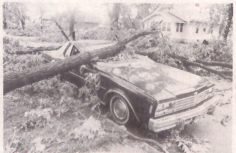
One of the many cars to have trees fall on them was this one parked in front of 1825 Ave. F.