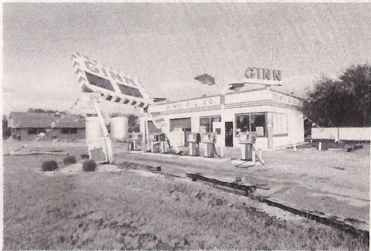
The Ginn Oil Co. station on Abbot Drive in nearby Carter Lake sustained major sign damage during the tornadoes and severe thunderstorms that hit the Omaha-Council Bluffs metropolitan area on July 15. Winds clocked at nearly 100 mph at nearby Eppler Airfield damaged or destroyed business signs throughout the area.