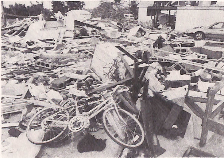
A bicycle rests in the rubble of the Nusser home, 2318 Ave. K, Friday evening moments after the storm hit.