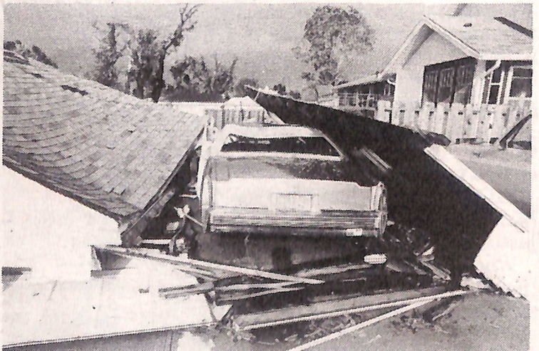
A Cadillac rests damaged under a carport located in the north 800 block of 25th Street, one of the hardest hit areas.