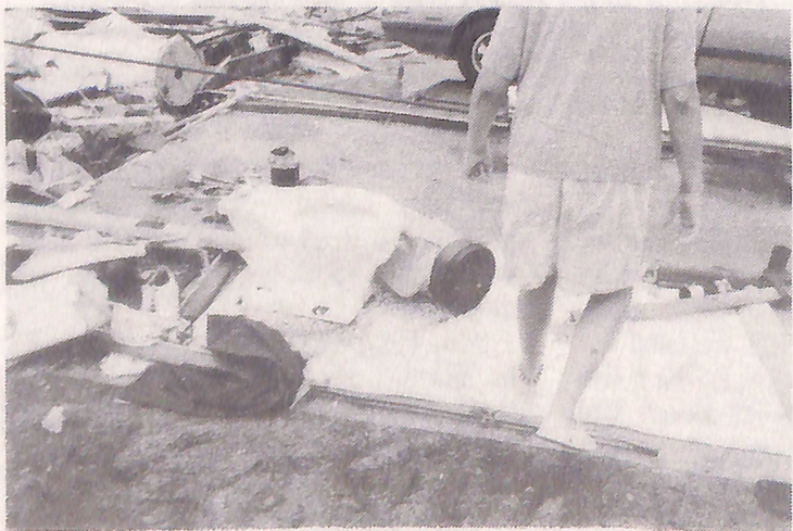
The comode in the Nusser residence at 2318 Ave. K remained bolted to the floor throughout the storm.