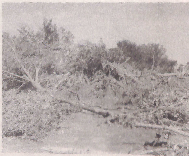
The major damage to trees occurred in the ninth fairway. A line of a dozen trees were uprooted or twisted off.