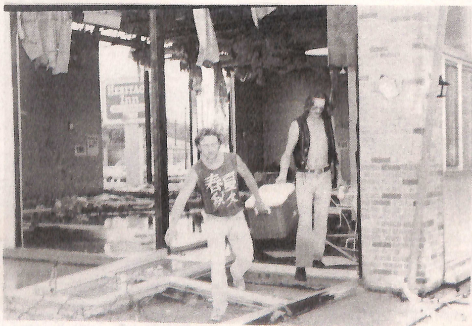
Guests at Heritage Inn, 3537 W. Broadway, had to pick up their belongings and head for the nearest undamaged motel. The motel refunded those guests that had to find other accommodations.