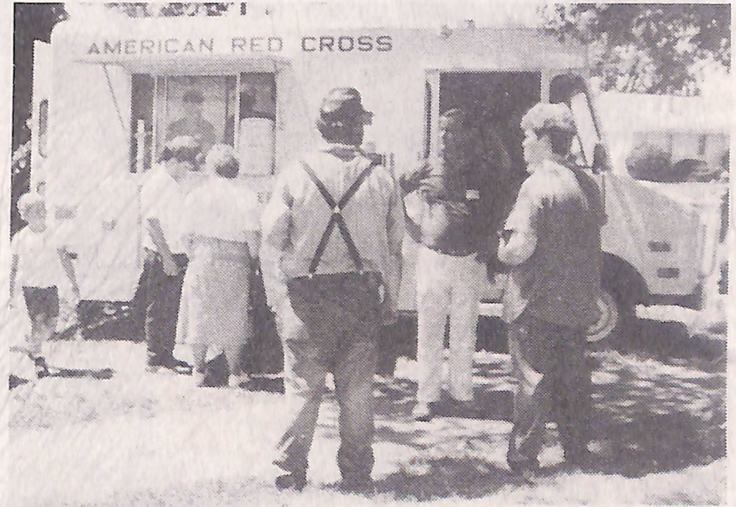
The American Red Cross mobilized its volunteers into the stricken area providing disaster assessment, first aid and food and refreshment. This van, set up on N. 25th St., offered sandwiches, coffee, rolls, soft drinks, milk, cereal, orange juice, iced tea, apples and oranges.