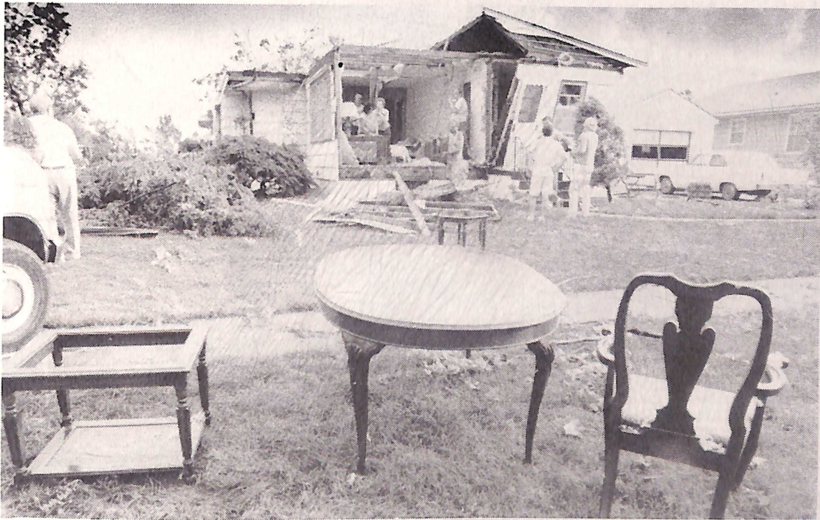
A dining room table rests on the lawn of a home destroyed by the tornado Friday evening, the night of the storm as family members and friends help unload household belongings in the background.