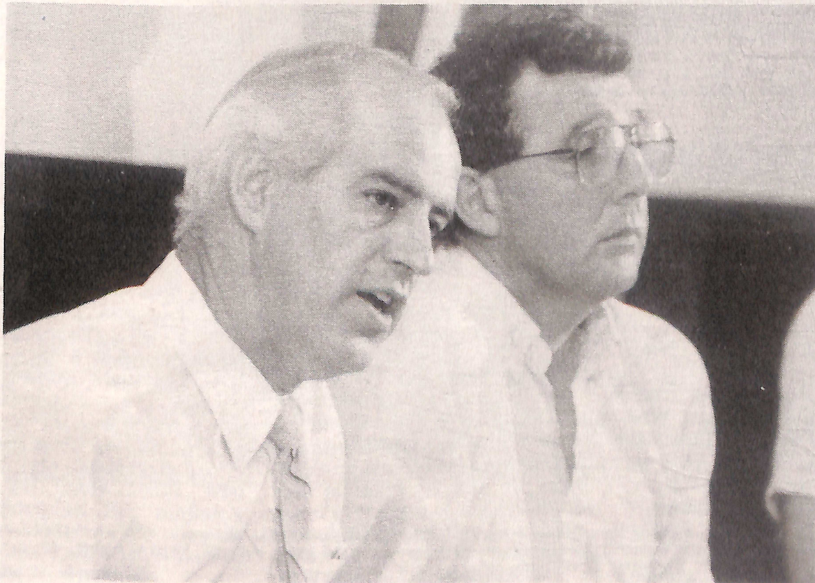
U.S. Rep. Jim Lightfoot, R-Iowa, met on Saturday after the tornado hit with Council Bluffs mayor Tom Hanafan and reporters to