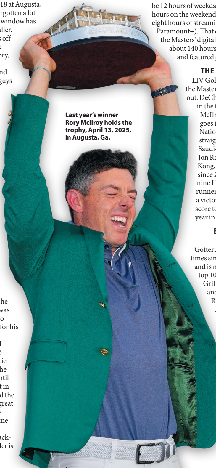
Last year's winner Rory McIlroy holds the trophy, April 13, 2025, in Augusta, Ga.

Age: 28 World ranking: 3. Worldwide wins: 2. Majors: None. Masters appearances: 4 Best finish: Tie for seventh in 2023. Masters highlight: Getting his first piece of crystal for an eagle on the par-5 13th in the final round of 2023. Masters lowlight: Four-putting the 16th green from 12 feet for triple bogey that caused him to miss the cut. Tap-ins: He is a big talent who finally has some trophies to show for it. He won the Wyndham Championship in a runaway last summer and then rallied to win The Players Championship three weeks ago. His vastly improved putting bodes well for him at the Masters.