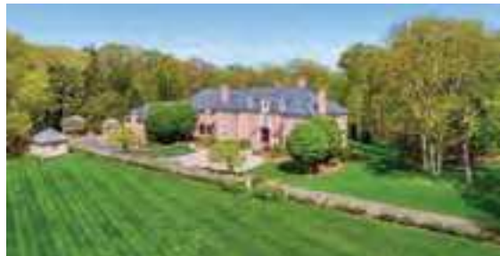
BERNARDSVILLE $5,400,000 Visit MountainTopManor.com