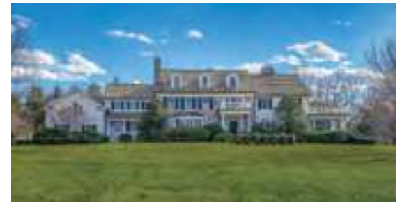
HARDING $3,675,000 Visit 2HollyHillLane.com