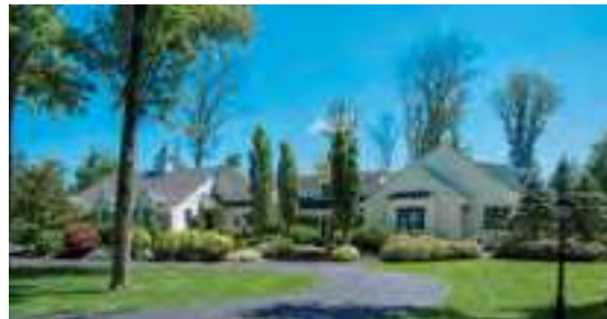
HARDING $2,499,000 Visit 25FoxHunt.com