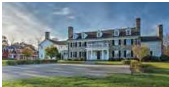
HARDING $5,490,000 Visit 30CherryLane.com