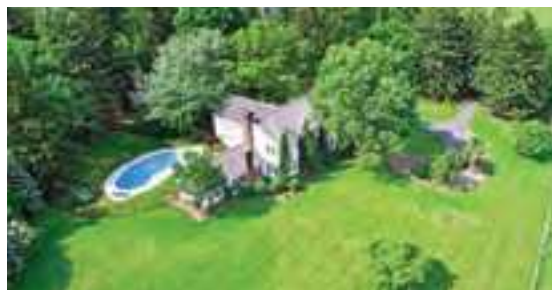
MENDHAM $2,250,000 Visit FoxwoodFarmNJ.com