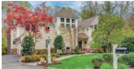
CHATHAM $2,229,000 Visit 49WoodmontDrive.com