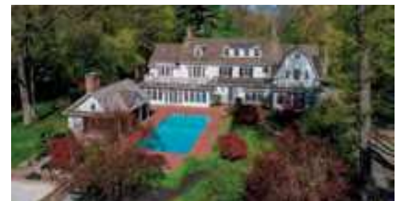
MORRIS TOWNSHIP $2,850,000 Visit 21Normandy.com