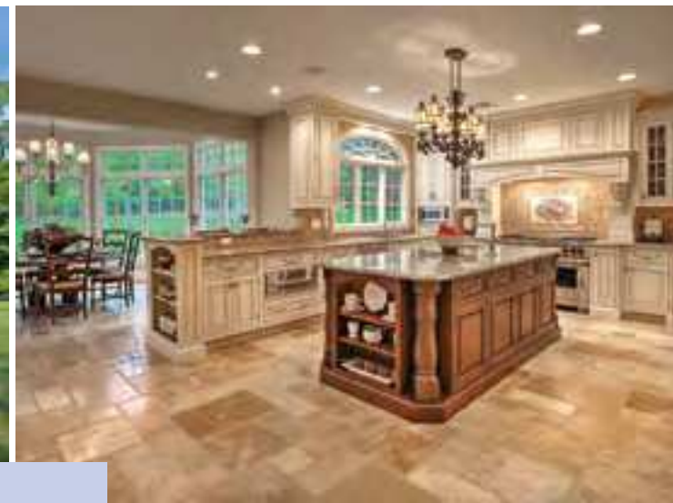
3 ROYAL OAK BASKING RIDGE, NEW JERSEY