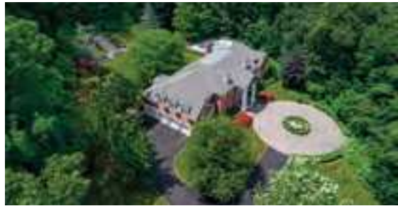
BERNARDSVILLE $1,999,000 Visit 5CobblefieldDrive.com