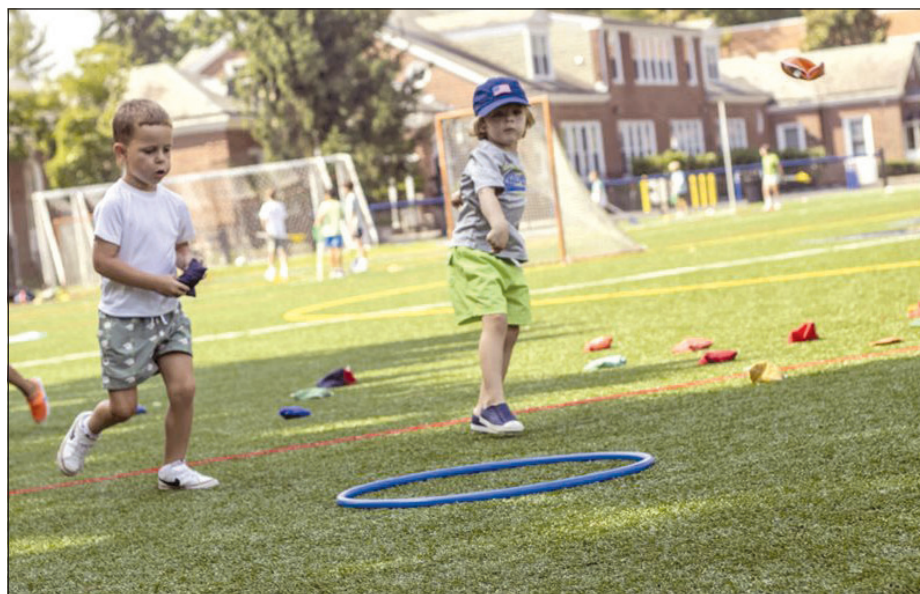
Children ages 3-17 can enjoy the Summer Camp offerings at Oak Knoll.