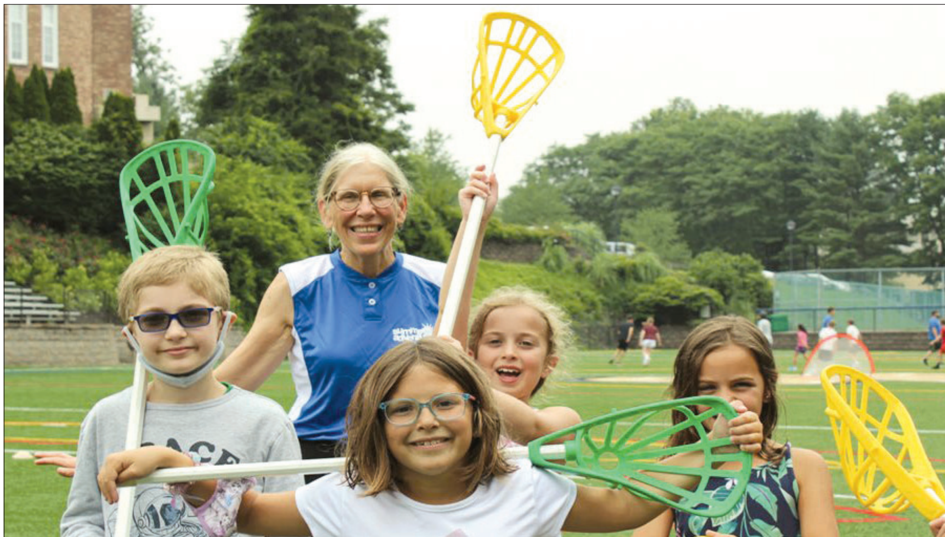
Children ages 3-17 can enjoy the Summer Camp offerings at Oak Knoll.