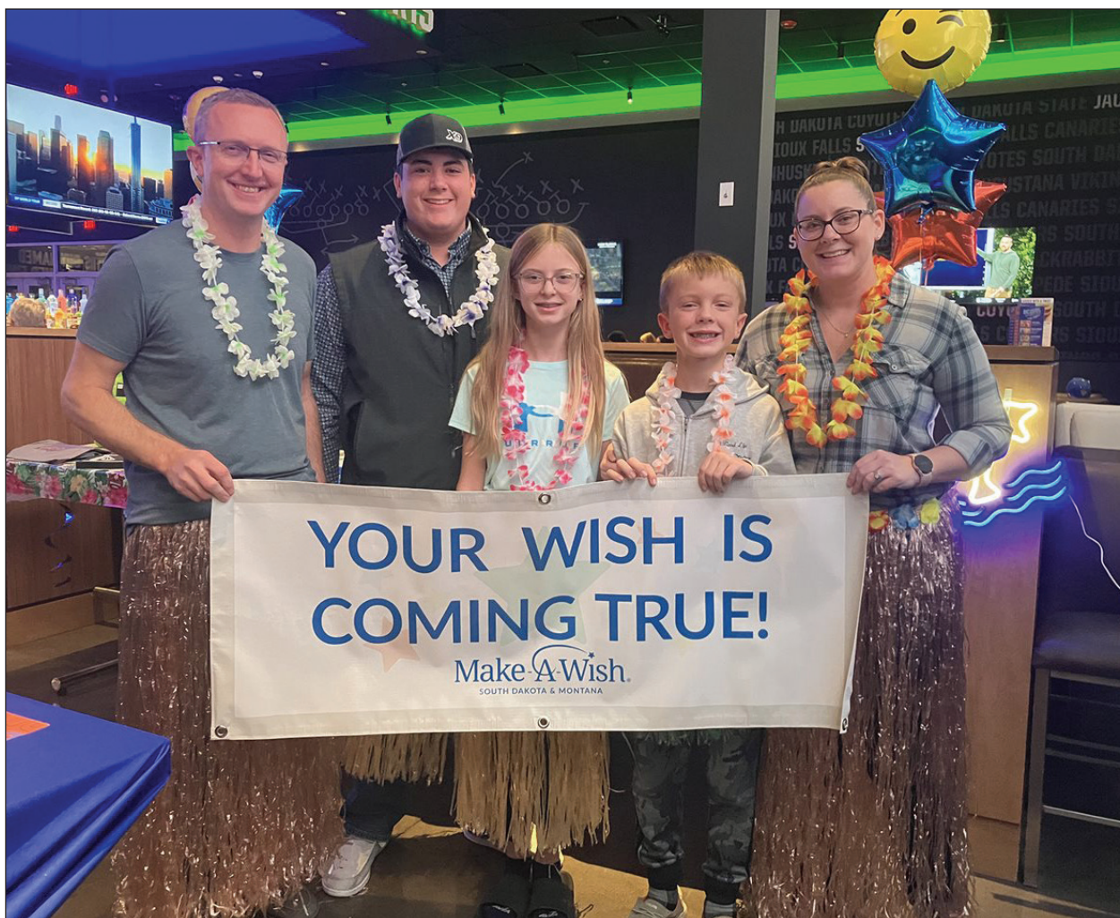
Dave & Buster's has reached $20 million in fundraising for Make-A-Wish since they first became a partner in 2012.

To continue generating enthusiasm and raising awareness for Make-A-Wish, Dave & Buster's has spearheaded a wide variety of creative fundraising approaches over the past 13 years, including: