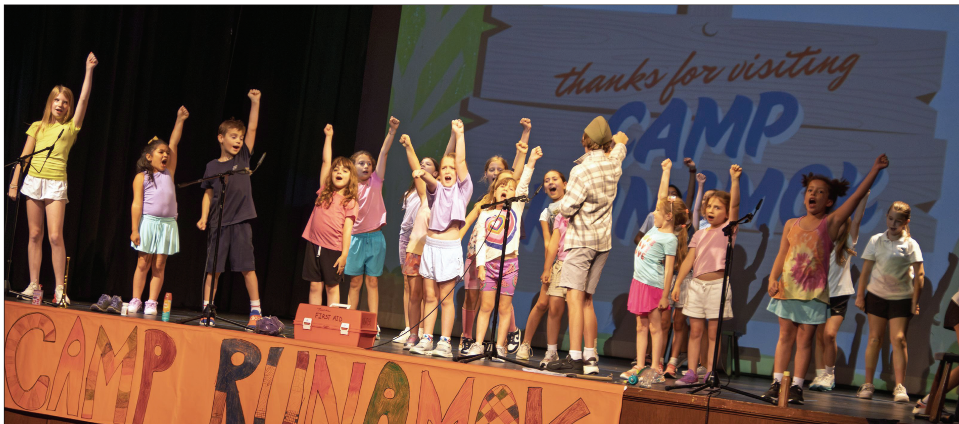
Children ages 3-17 can enjoy Summer Camp offerings at Oak Knoll.