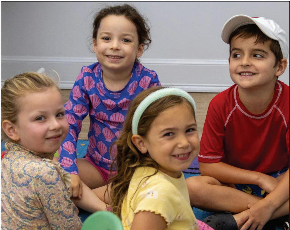
Children ages 3-17 can enjoy Summer Camp offerings at Oak Knoll.