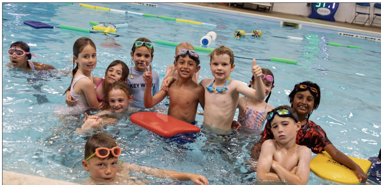
Children ages 3-17 can enjoy Summer Camp offerings at Oak Knoll.