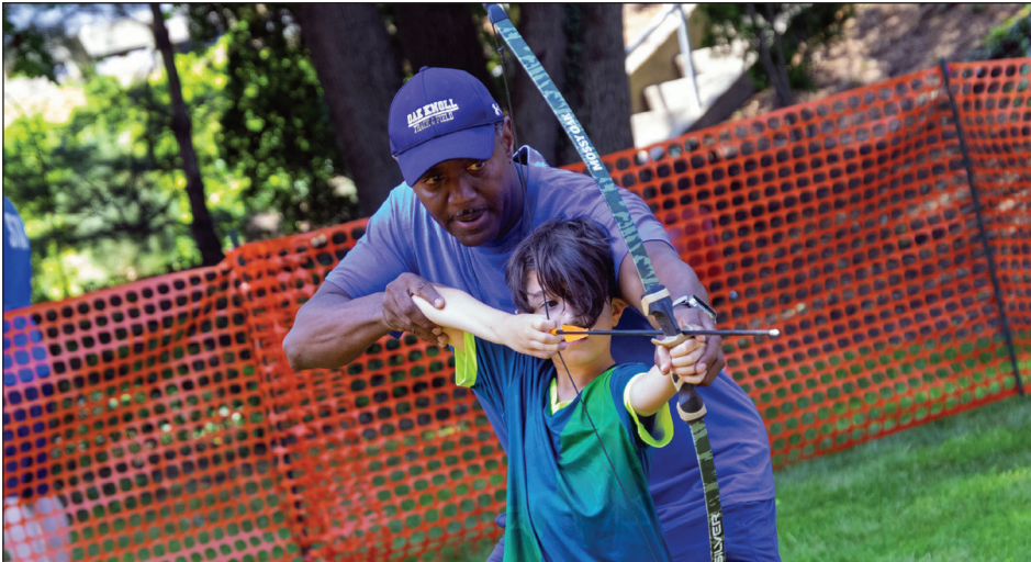
Children ages 3-17 can enjoy Summer Camp offerings at Oak Knoll.

busy schedules. Whether your child is a budding artist, an aspiring scientist, or just looking for new adventures, Oak Knoll Summer Adventures promises a season of unforgettable memories. Register today at Oak Knoll School Summer Adventures and give your child the gift of a summer they'll never forget!