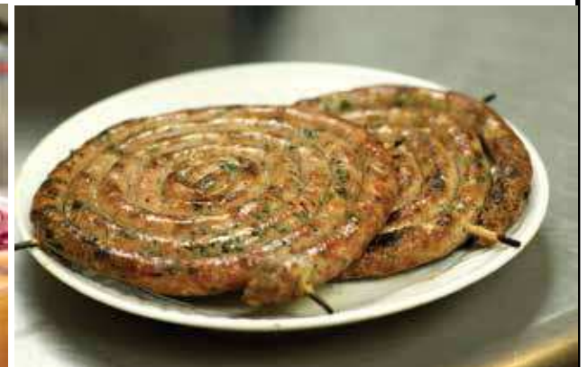
House Made Sausages

Now offering local grass fed organic beef