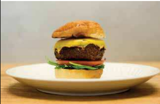
Fresh Ground Burgers