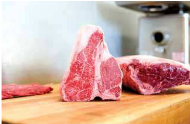
Steaks Cut To Order