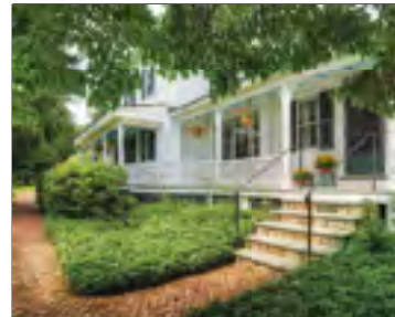
81 Mountainside Rd, Mendham $699,000