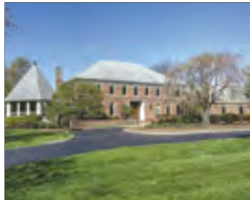
460 Cherry Ln, Mendham $1,499,000