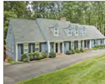
10 Green Hills Rd, Mendham $1,045,000