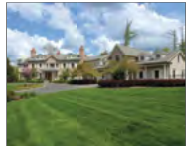
1 Pine Hollow Ln, Mendham Twp. $2,400,000