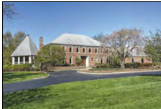
460 Cherry Lane, Mendham $1,499,000