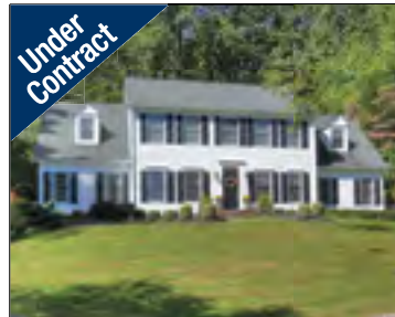
4 Connet Ln, Mendham $1,150,000