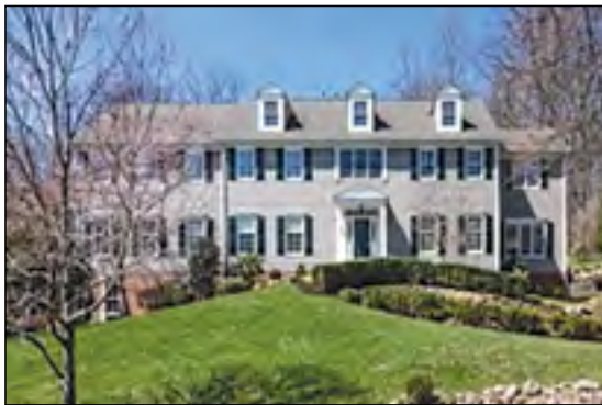
12 Brookrace Drive, Mendham $1,285,000

WHO IS #1? BUYING OR SELLING, YOU ARE #1 WITH COLDWELL BANKER