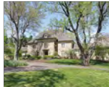
464 Cherry Ln, Mendham $2,350,000