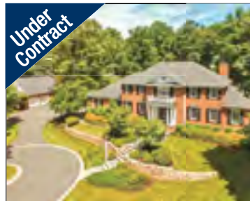
5 Amalia Ct, Mendham Twp. $2,375,000