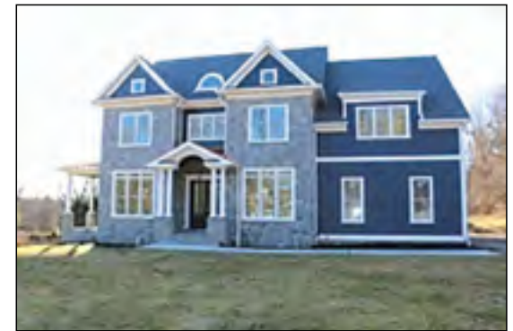
86 Mountain Ave, Mendham $1,275,000