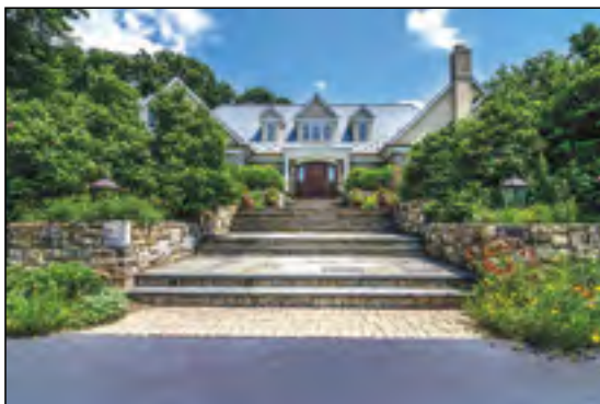
4 Cromwell Lane, Mendham $1,850,000