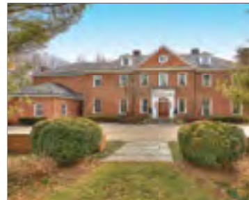
19 Country Dr, Harding $2,600,000