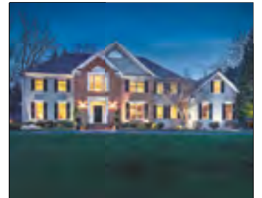
1 Kendall Ct, Mendham $859,000