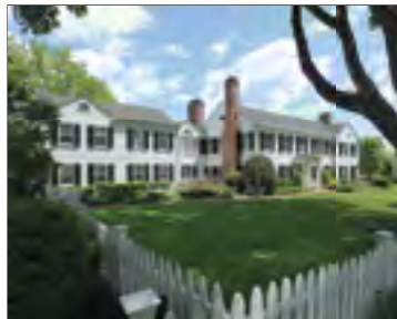
22 Talmage Rd, Mendham $2,100,000

NO COMMISSION IS WORTH MY REPUTATION. 29 Years of Real Estate Experience and Mendham resident since 1969!