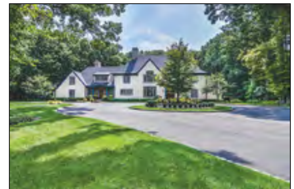
24 Mount Pleasant Road, Mendham $1,750,000