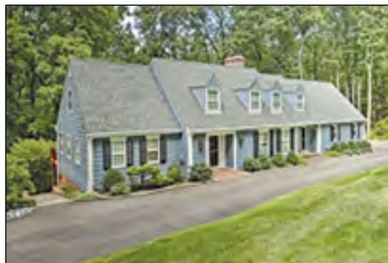
10 Green Hills Road, Mendham $1,045,000