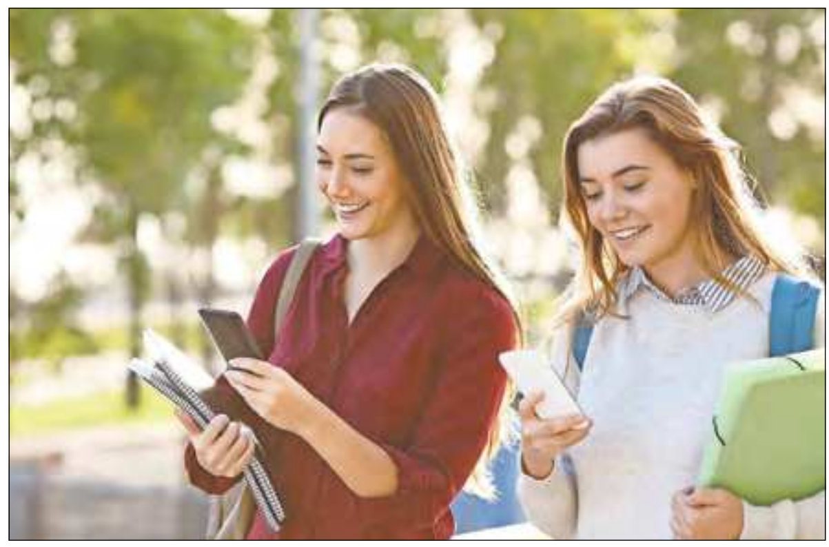
Costs don't have to be a burden as back-to-school tech upgrades loom.

Whether you are purchasing a device as a gift or for yourself, this back-to-school season, consider upgrading devices in a smart way that's affordable and sustainable.