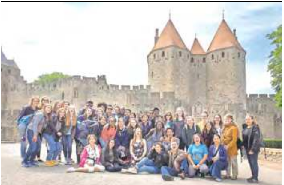
Villanova University found that graduates who spent time in a different country as part of their studies had better opportunities and a higher job placement after graduation than those who did not.

Villanova University found that graduates who spent time in a different country as