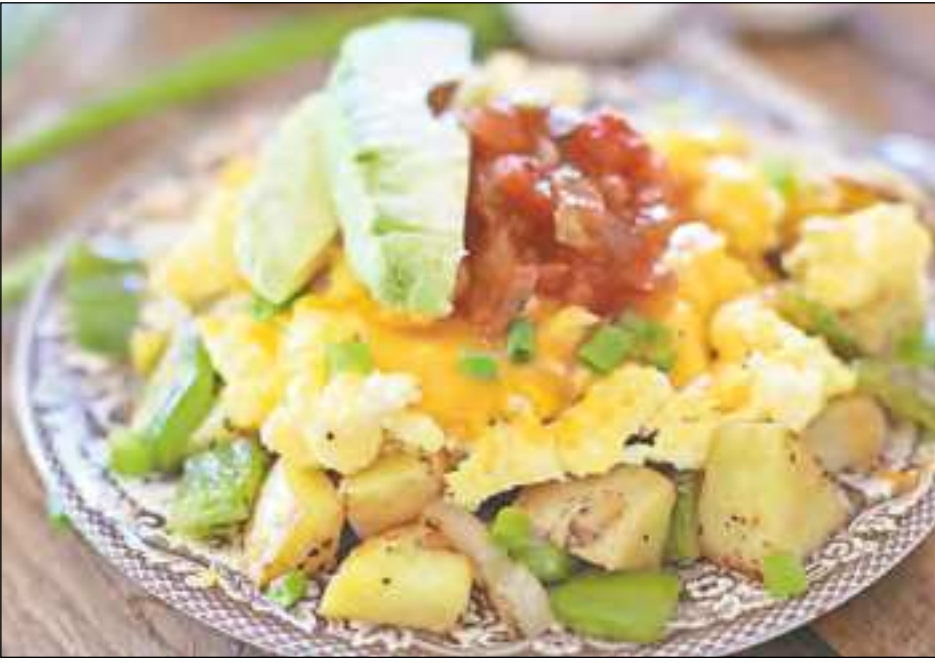
Make Ahead Breakfast Bowls will fuel your family throughout the day with superior nutrition.

Learn to love the alarm: Rather than just setting one alarm for waking up, try setting several to keep your morning rou-