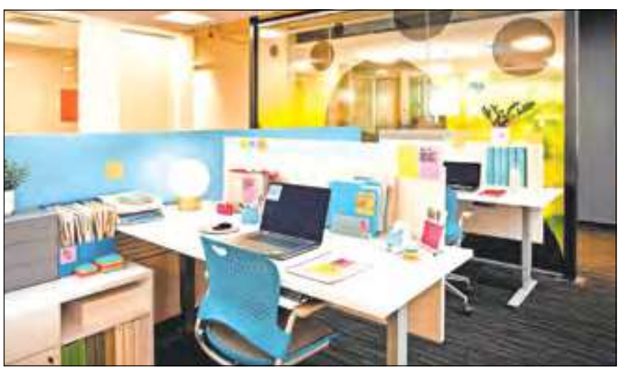
A new Post-it Brand productivity study found that more than 1 in 4 Americans feel completing everything in their weekly to-do list is harder than running a marathon.