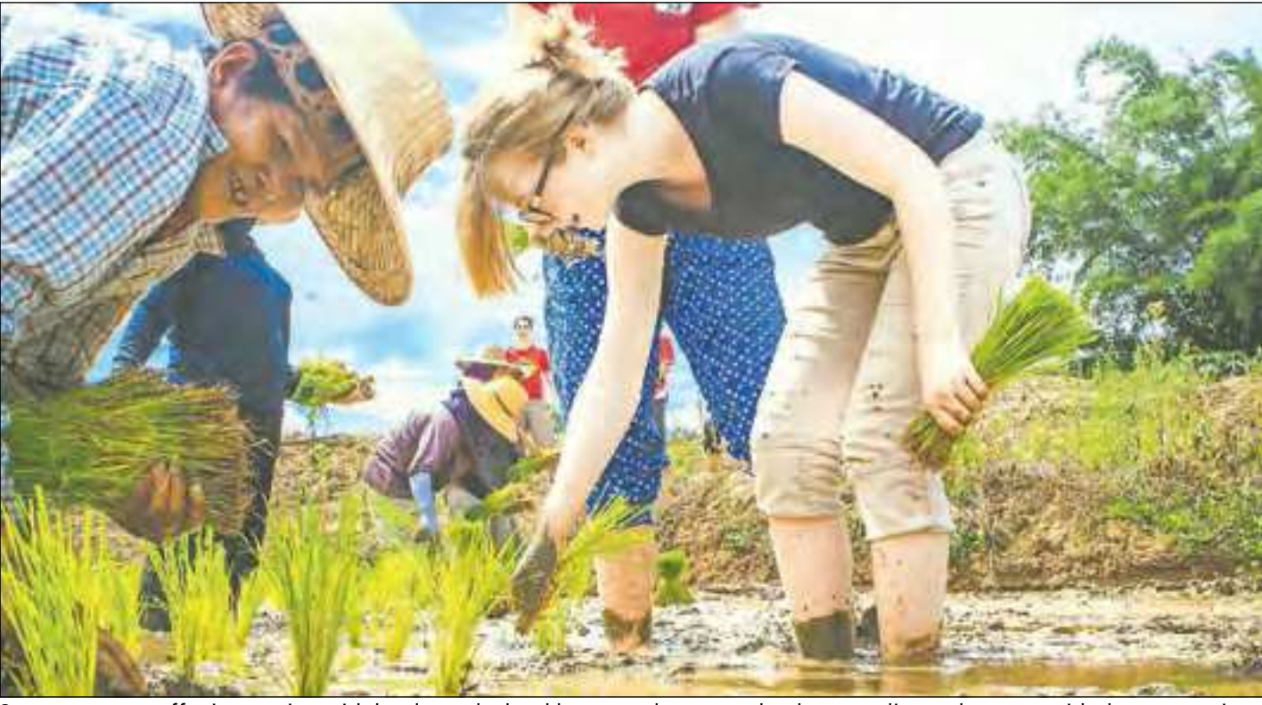
Some programs offer interaction with local people, local language lessons and a chance to live and engage with the community.

CIEE: Council on International Educational Exchange, a nonprofit that operates more