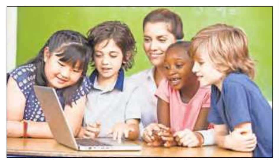
Technology is changing the way lessons are taught and information is absorbed, making it easier for students to become more engaged and collaborative.

Classrooms that keep up with the pace of technological innovation offer their students more opportunities to connect and with the material.