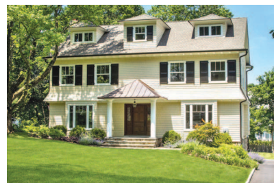
39 Noe Ave., Madison $1,665,000

I get TOP DOLLAR for my clients - when houses are prepared properly they sell higher & faster than the norm. If you need help, call me on (973) 951-5859