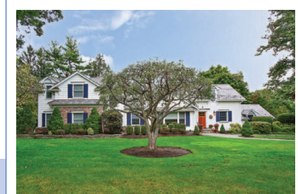
41 East Lane, Madison $1,325,000