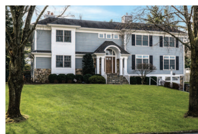
8 Runnymede Rd., Chatham $2,099,000

Visit one of our Open Houses this spring go to www.BernieMcDounough.com to find dates.