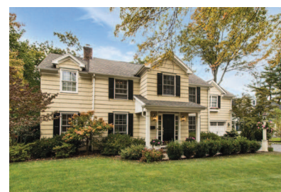
29 Woodland Rd., Madison $1,389,000