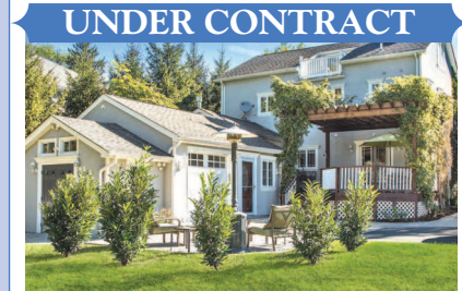
23 Gibbons Place, Madison $1,020,000

Using my expertise to provide each and every client with the highest level of service. Integrity, hard work and knowledge make it happen! As a real estate professional for the past 15 years I work closely with my clients to get their homes "Market Ready". Using my contacts from: contractors to painters to stagers and professional photographers. Top to bottom I work with my clients to make the experience seamless and rewarding, commanding top dollar for my listings! I know the communities I serve; Madison, Chatham, Florham Park, Morristown, Summit, Harding Bernardsville and Basking Ridge and can answer the questions that the buyers want to know. In the job of house hunting I will search high and low till we find the right community and house that meets my clients needs.