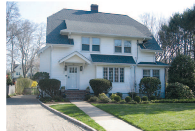
22 Hillcrest Rd., Madison $925,000