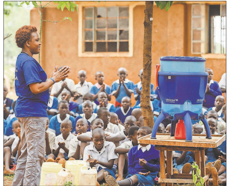
The Follow the Liters program brings needed clean drinking water to students globally.

For those thinking charitably this season, consider that for every LifeStraw product purchased, one child in a developing community is provided with clean drinking water for an entire school year through the company's Follow the Liters program. As of now, Follow the Liters has provided safe drinking water to 633,000 students at 1,000 schools, and plans to reach one million students by early 2018. LifeStraw products are available for purchase at specialty retailers and online at www.lifestraw.com .