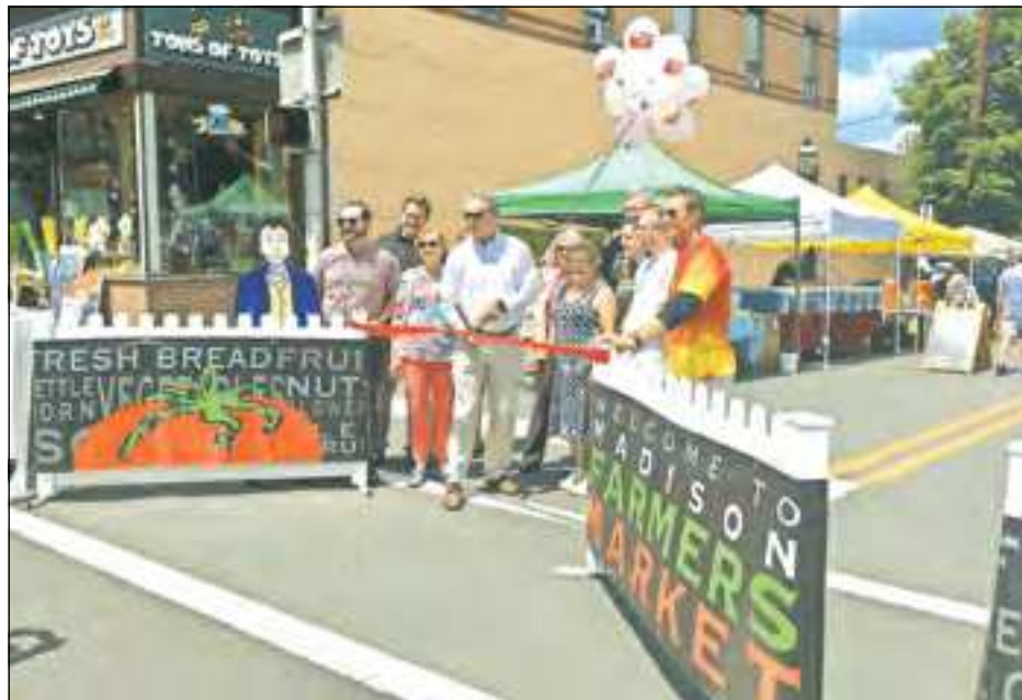
The Madison Farmers Market continues to thrive on Central Avenue. The market runs 2 to 7 p.m. Thursdays until Oct. 26.