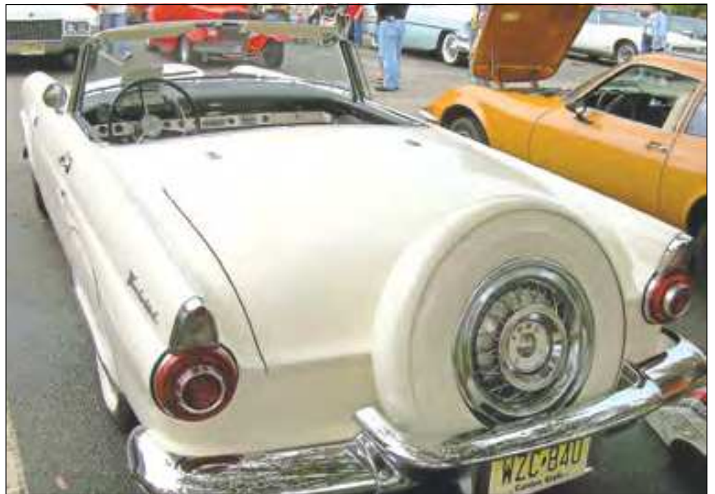
The Madison Area Chamber of Commerce and Madison P.B.A. 92 will host their 25th annual Madison Car Show on Saturday, Oct. 7.