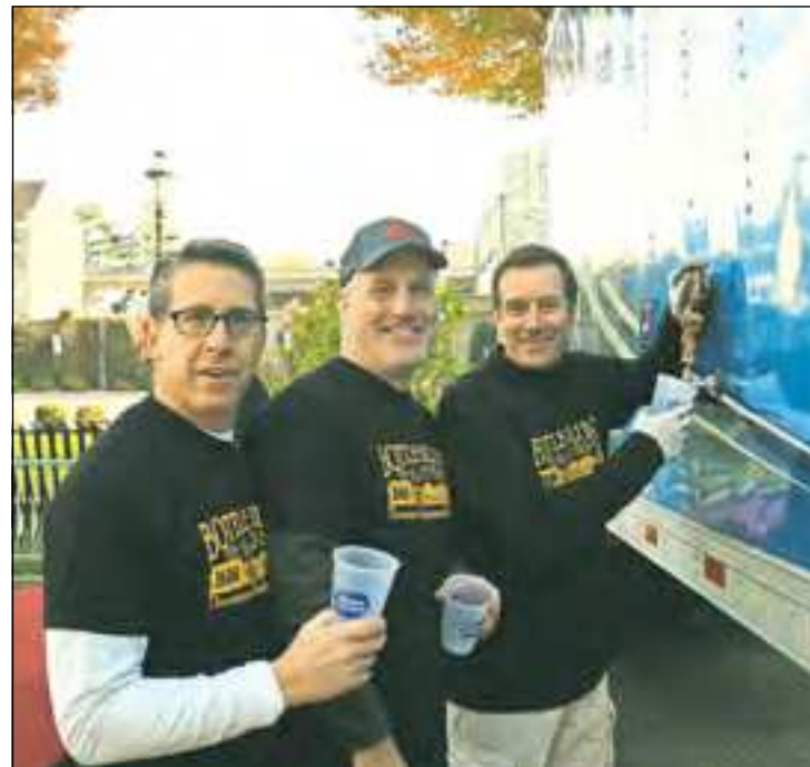
The Bottle Hill Day Beer Garden returns for its seventh year to its location between Prospect Street and Maple Avenue on Kings Road.

The Beer Garden will be open from noon to 6 p.m.