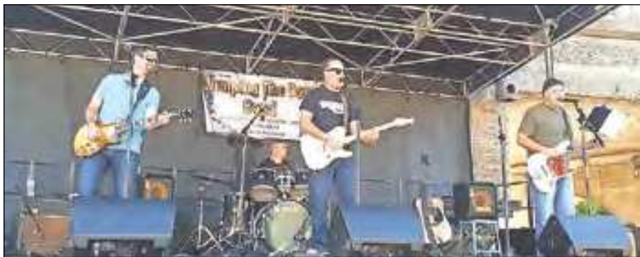
Local favorite, Jumping the Gun , above , will close out Bottle Hill Day at 4:45 p.m. at the Hartley Dodge stage.