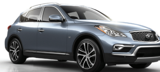
2017 INFINITI QX50

NEW 2016 INFINITI Q50 PREMIUM AWD. MSRP: $43,020, Model Number: 91416, 2 or more available at this price. Sign and Drive lease $359/mo. for 39 mos. w/$0 due at signing, 10000 miles per year. Bank fee, reg/admin fee, and applicable MA state sales tax included. No security deposit. Offer reflects tier 1 credit approval. Offer ends 10/31/16. In stock models only. *Photos are for illustration purposes only.