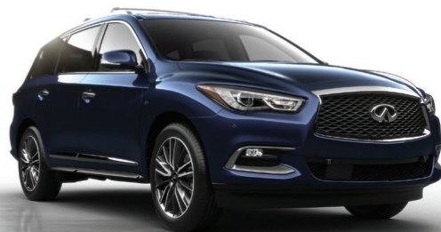
2016 INFINITI QX60 AWD

NEW 2017 INFINITI QX50. MSRP: $38,445, Model Number: 81217, 2 or more available at this price. Sign and Drive lease $399/mo. for 39 mos. w/$0 due at signing, 10000 miles per year. Bank fee, reg/admin fee, and applicable MA state sales tax included. No security deposit. Offer reflects tier 1 credit approval. Offer ends 10/31/16. In stock models only. *Photos are for illustration purposes only.