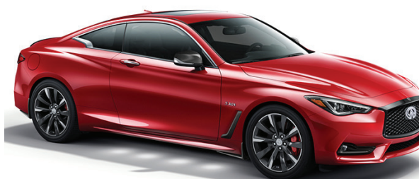
2017 INFINITI Q60 3.0t PREMIUM

NEW 2016 INFINITI QX60 AWD. MSRP: $45,895, Model Number: 84216, 2 or more available at this price. Sign and Drive lease $479/mo. for 39 mos. w/$0 due at signing, 10000 miles per year. Bank fee, reg/admin fee, and applicable MA state sales tax included. No security deposit. Offer reflects tier 1 credit approval. Offer ends 10/31/16. In stock models only. *Photos are for illustration purposes only.