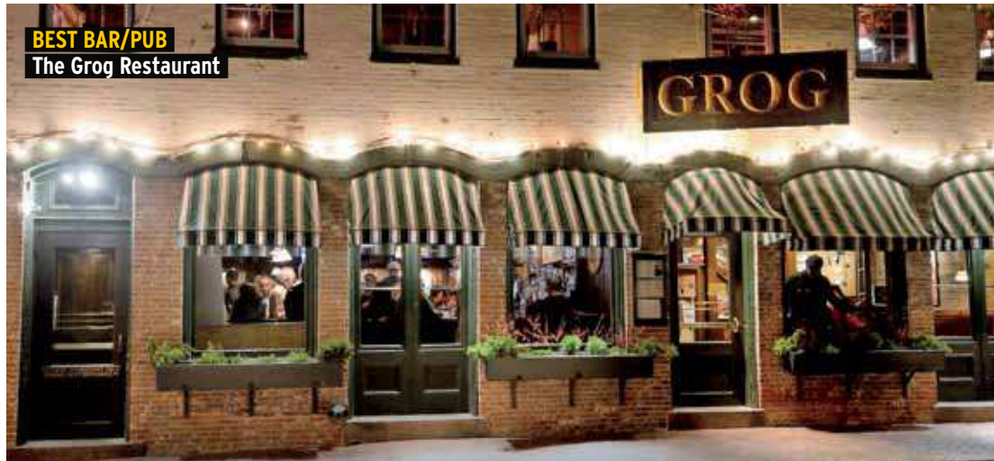
BEST BAR/PUB The Grog Restaurant