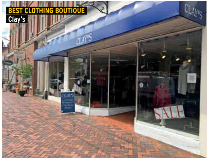
BEST CLOTHING BOUTIQUE Clay's