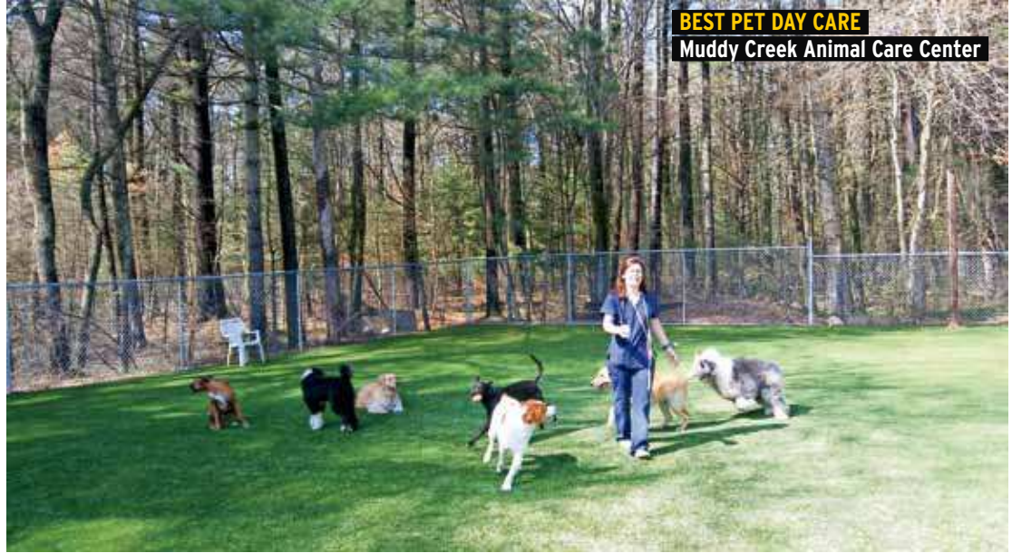
BEST PET DAY CARE Muddy Creek Animal Care Center

Why it's the Best: As active members in the community, we seek to build long-term relationships based on trust,