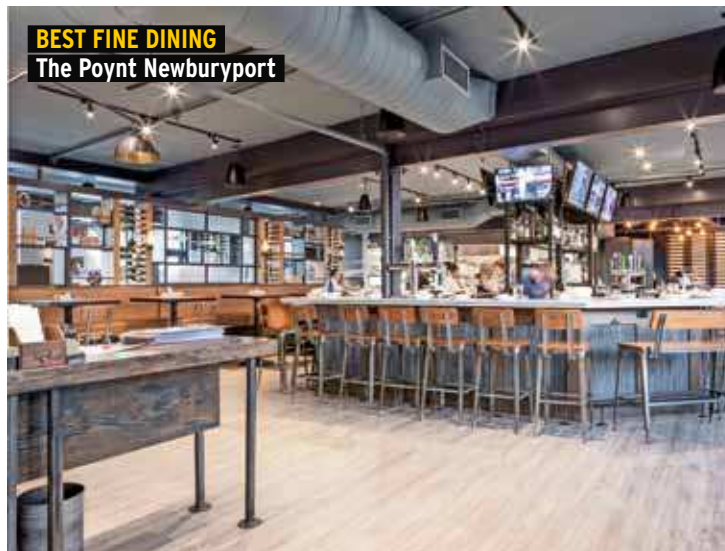
BEST FINE DINING The Poynt Newburyport