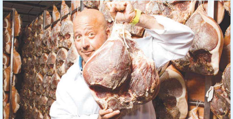
Andrew Zimmern as seen in "Bizarre Foods"

In the July 25 season premiere, Zimmern seeks out the history of cowboy culture. With a cowboy hat on his head, he visits a modern-day vaquero, who shares with him a centuries-old dish: the barbacoa, which is a whole cow's head that's slowly roasted until it's perfectly tender.