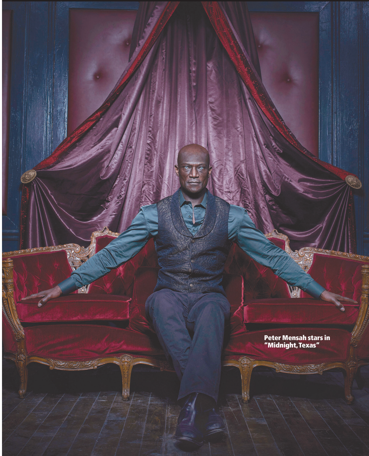
Peter Mensah stars in "Midnight, Texas"