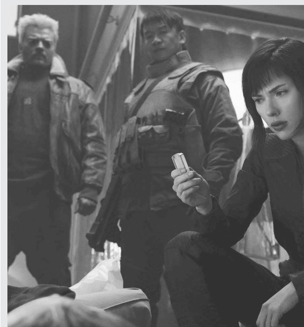
Pilou Asbæk, Chin Han and Scarlett Johansson in a scene from "Ghost in the Shell"

Frank, however, believes that attending a similar school prevented Mary's mother from having a normal childhood, and he turns down the scholarship, much to the chagrin of his own estranged mother (Duncan), who launches a battle for custody of her granddaughter. Director: Marc Webb. Stars: Chris Evans, Mckenna Grace, Lindsay Duncan, Jenny Slate, Octavia Spencer. 2017. 101 min. Drama.