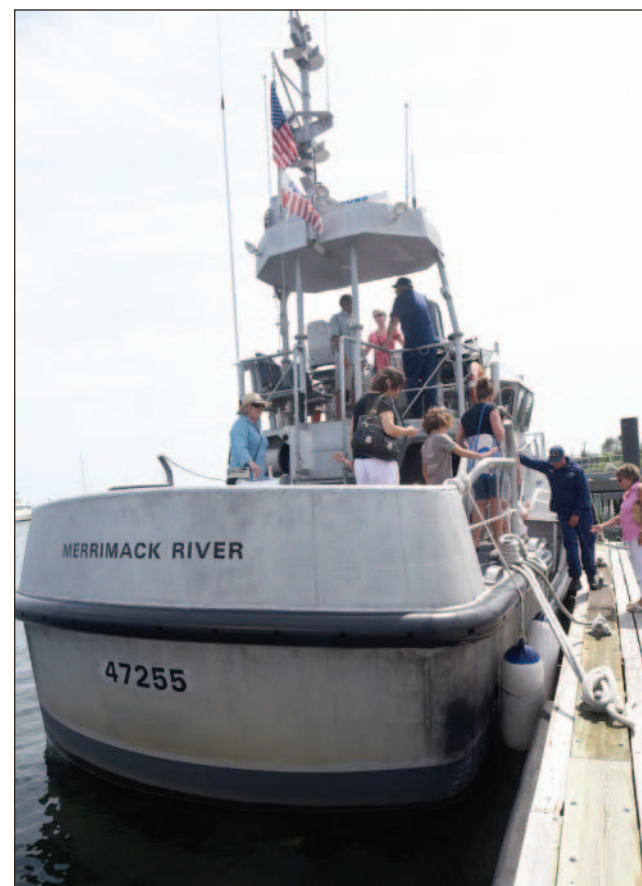
Visitors tour a motor lifeboat at U.S. Coast Guard Station Merrimack during an open house held for Yankee Homecoming.

To learn more about Newburyport's history: Clipperheritagetrail.com — Free downloadable tours, brochures, maps and free smart phone tours. An American Association of State and Local History Merit Award Winner.