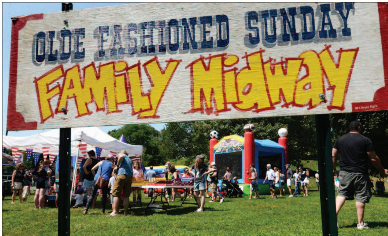
A bouncy house was one of the attractions in the Family Midway during Olde Fashioned Sunday.