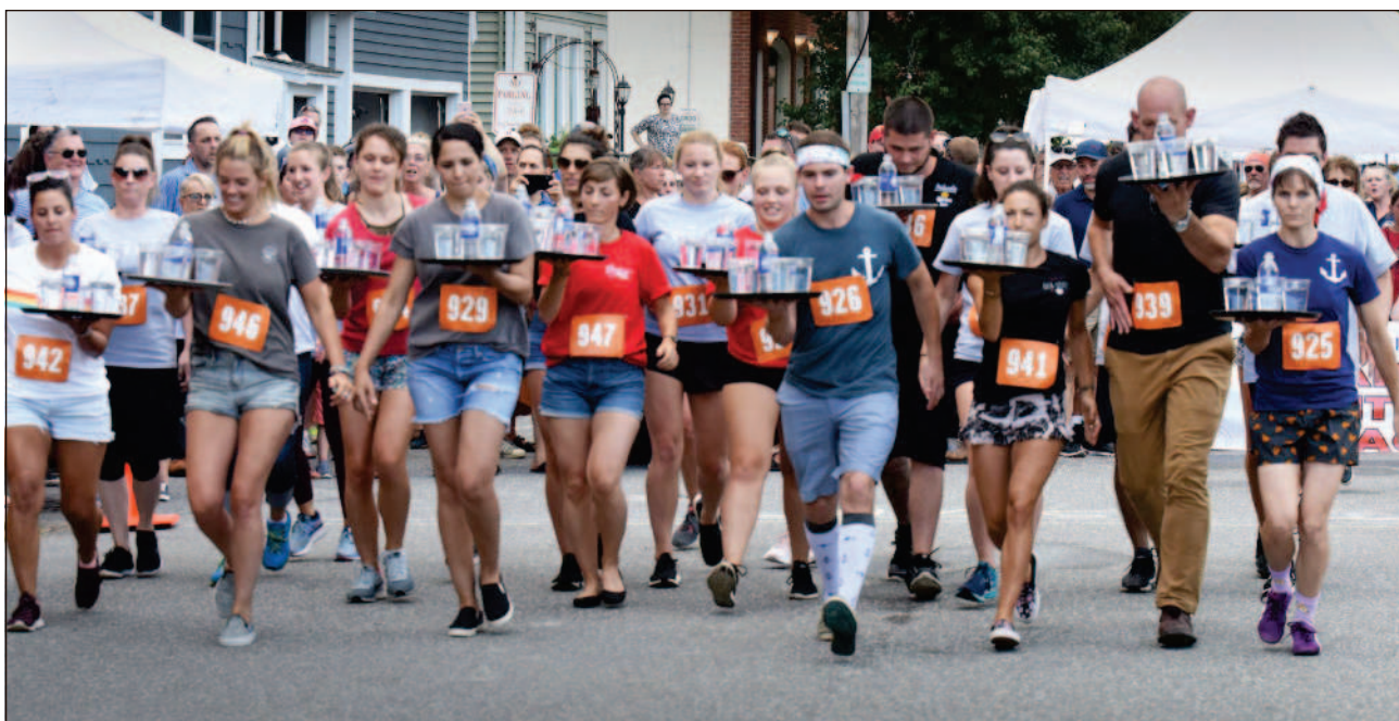
Contestants carry trays of glasses of water at the start of the Waiter/Waitress Race in 2019.

Local high school bands have submitted videos of their performances and the winners chosen to play during Yankee Homecoming and to receive prizes of $100. The first-prize band will perform Monday, Aug. 2, as opening act at the Waterfront Concert. The winners in the Acoustic/Colo and Most Viewed Video categories will perform during the parade Sunday, Aug. 8. Check NEWBURYPORTYH-BATTLE on Instagram. For more details, go to www.yankeehomecoming.com.