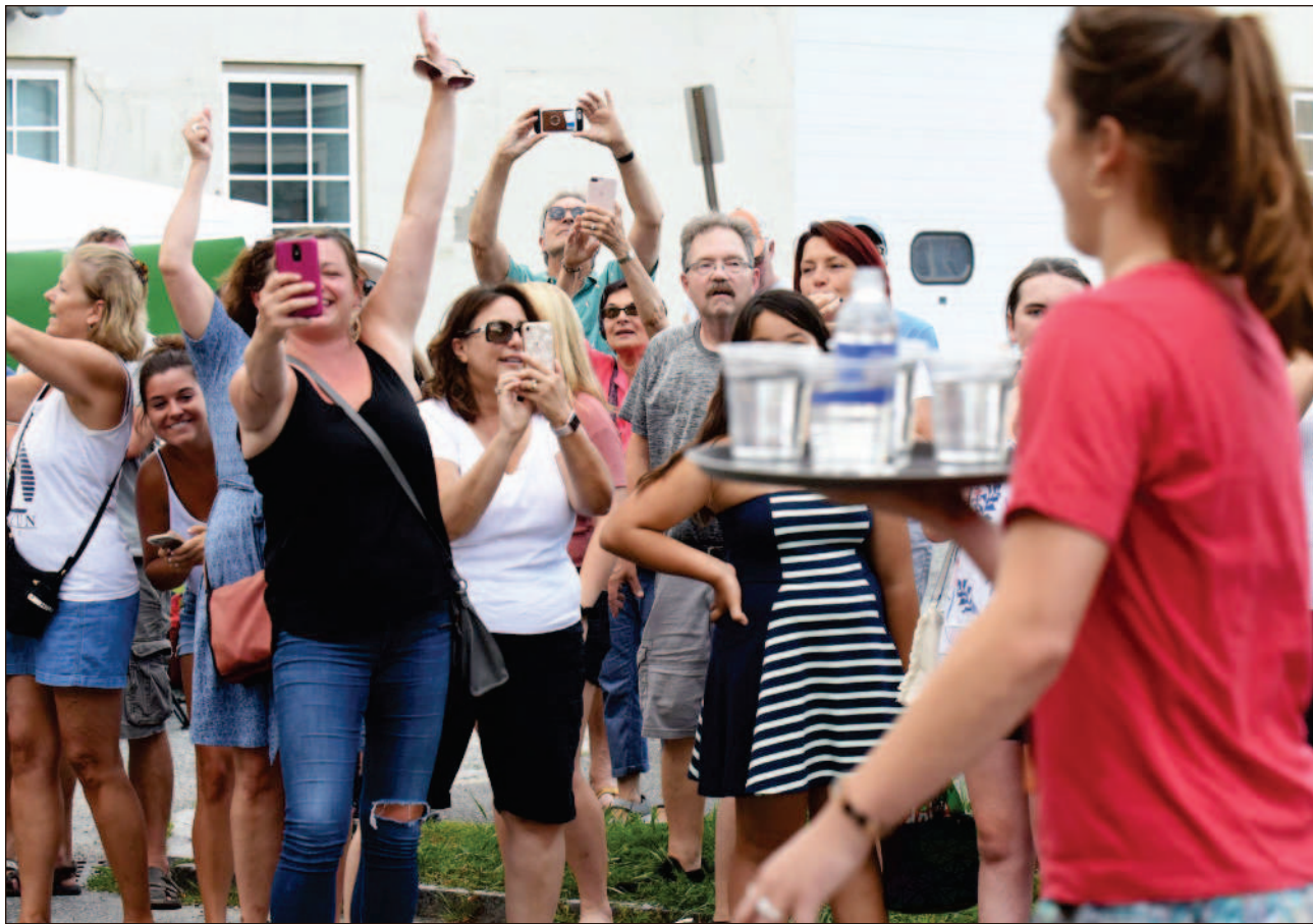
People cheer on the contestants in the Waiter/Waitress Race.