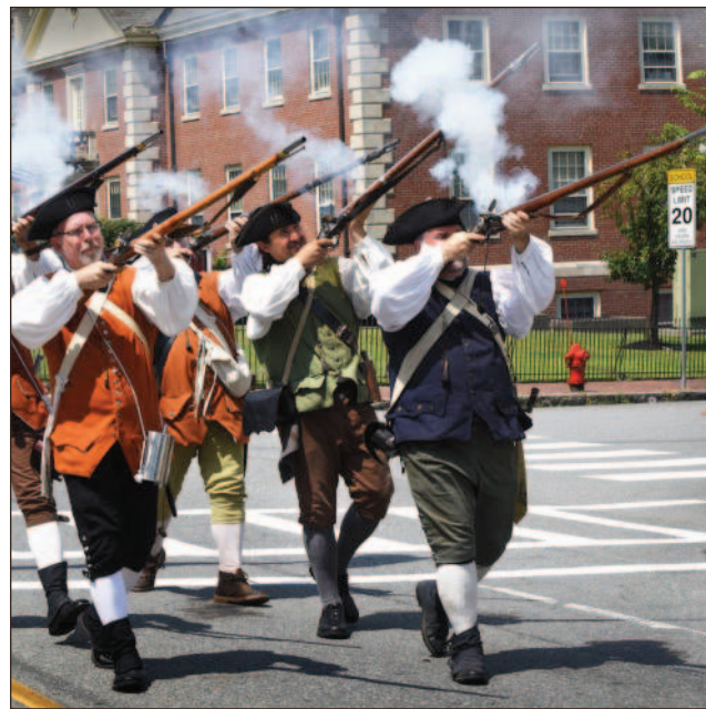
The Acton Minutemen fire their muskets at the top of Green Street during the Yankee Homecoming Parade.

Yankee Homecoming always concludes with a parade on the second Sunday of the celebration.