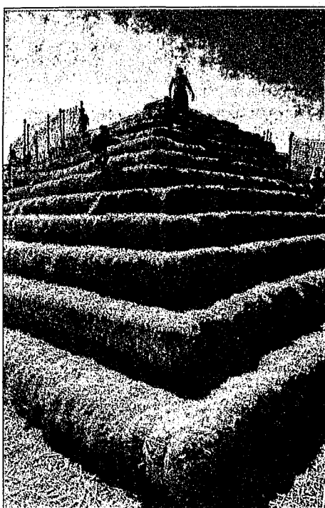
Bales of hay are stacked to make a hay pyramid for climbing at the Stanly Lane Pumpkin Patch in Napa this past weekend. Local pumpkin patches are open for business as the fall holiday season is quickly approaching.

St. Helena FFA pumpkin patch 1109 Silverado Trail St. Helena Open Saturday and Sunday in October, 11 a.m. to 5 p.m.