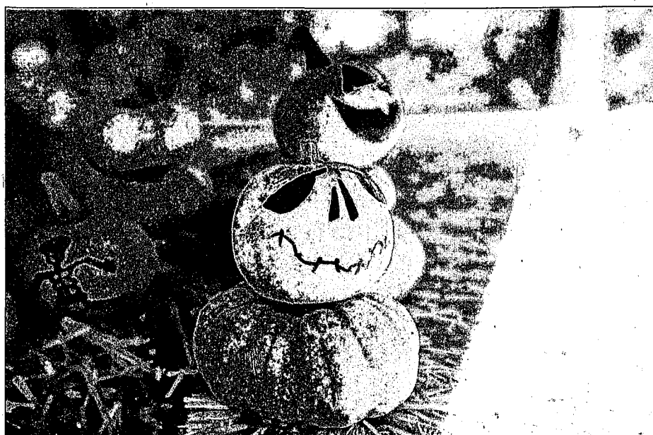
Decorated pumpkins are stacked by the register at Stanly Lane Pumpkin Patch as families searched for their pumpkins this past weekend.