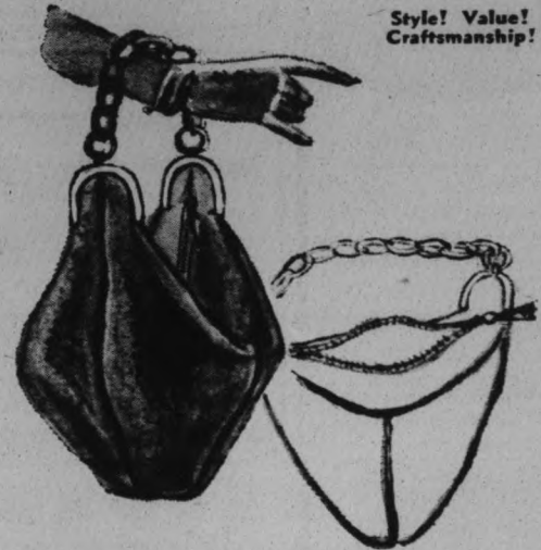
Style! Value! Craftsmanship!