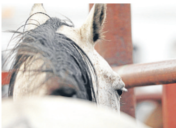
A horse waits in a pen at the Don Harrington Rodeo during the 2019 Butte-Silver Bow County Fair at the Butte Vigilante Saddle Club and rodeo grounds.