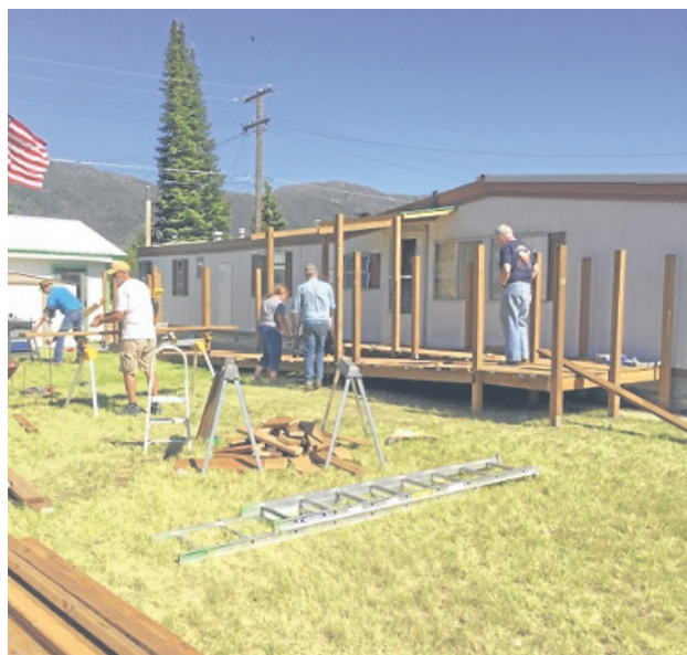
Day of Caring 2016