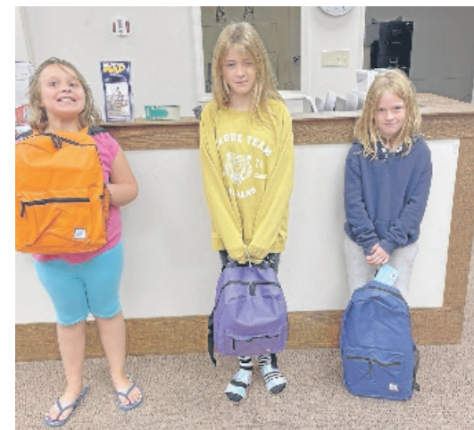
Dress a Child

Due to COVID-19 our volunteers, the last two years, purchased clothing for the youths based on written information provided by the families. Clothing was then picked up by the families at our office.