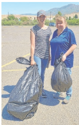
Day of Caring 2021