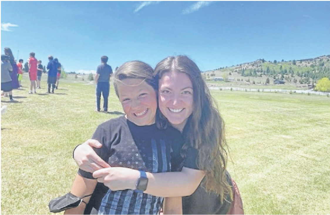
Big Brother Big Sisters of Silver Bow Inc.

Camp H2O-ACI, Inc. hosts a leadership camp targeting Anaconda middle school students. Camp is 3.5 days of intense positive/social emotion learning free to students.