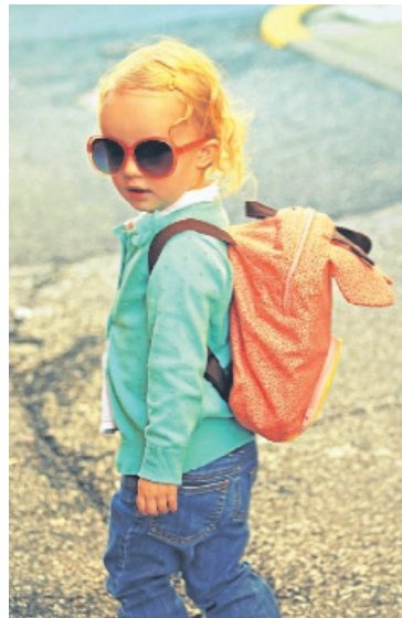
Butte 4 C's

Community Based Mentoring provides children facing adversity with strong and enduring, professionally supported, 1 to 1 relationships that change their lives for the better, forever.