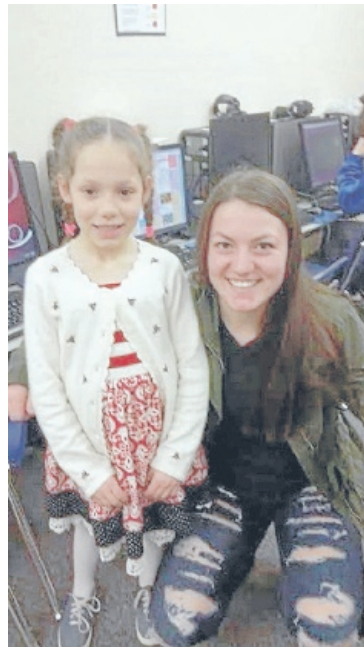
Big Brother Big Sisters of Silver Bow Inc.

Community Based Mentoring provides children facing adversity with strong and enduring, professionally supported, 1 to 1 relationships that change their lives for the better, forever.