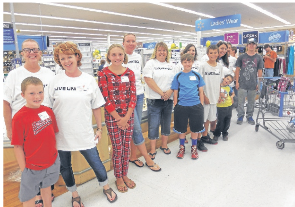
Dress a Child

Personal Injury Attorneys, PLLC www.joyce-macdonald.com In the Historic Finlen Hotel, ground floor 100 E Broadway St., Butte, MT