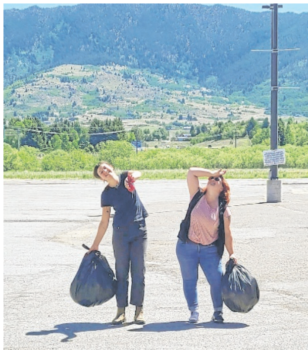
Day of Caring 2021

“If our hopes of building a better and safer world are to become more than wishful thinking, we will need the engagement of volunteers more than ever.” — Kofi Annan