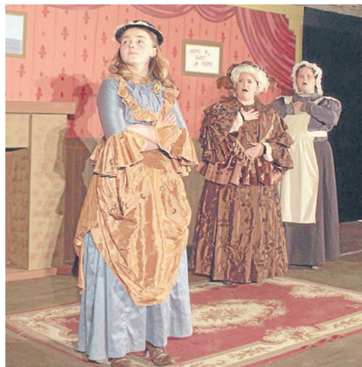
Open Theatre Project