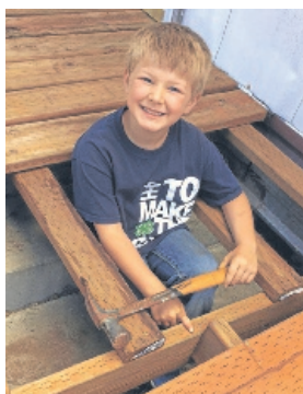
Day of Caring 2016