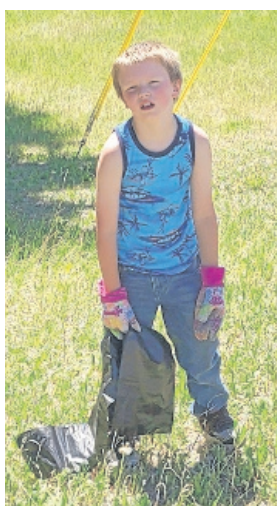
Day of Caring 2021