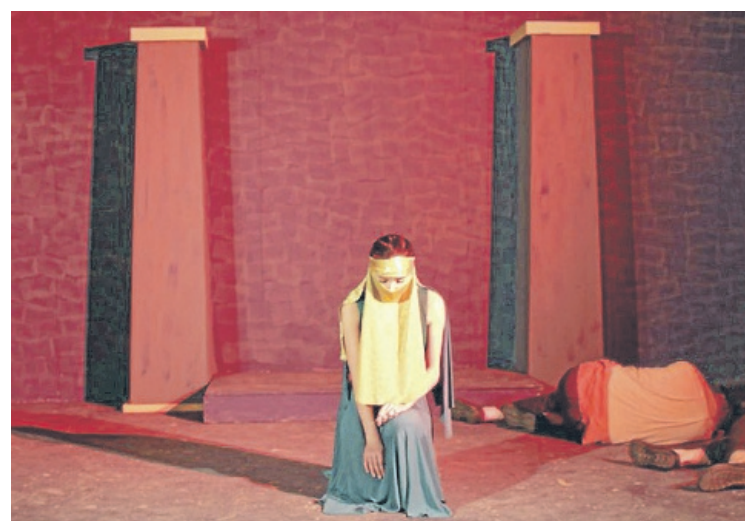
Open Theatre Project

Thank you for caring for our community, we are proud to support the United Way.